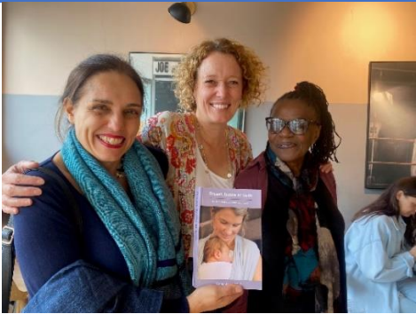
From Left to Right

If you have an enquiry on the day contact Yvonne at 07939 048 212